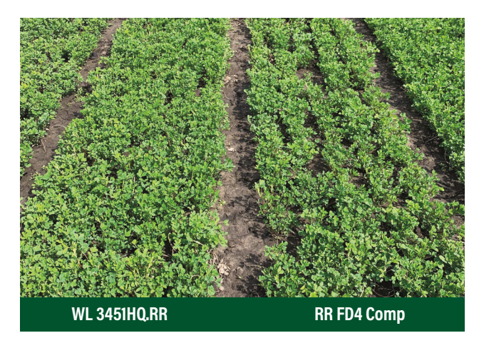
2020 Wisconsin Demo. Photo from May 6, 2022.

W-L Alfalfas with the UltraCut<sup>™</sup> Disease Package can provide agronomic advantages by helping protect your crop against yield-limiting and evolving Anthracnose and Aphanomyces disease strains. You could see an increase in yield with each cutting when disease threatens your alfalfa and expand the acres you're able to plant. Help grow a healthy alfalfa crop even in field conditions susceptible to Anthracnose and Aphanomyces threats with the UltraCut<sup>™</sup> Disease Package.