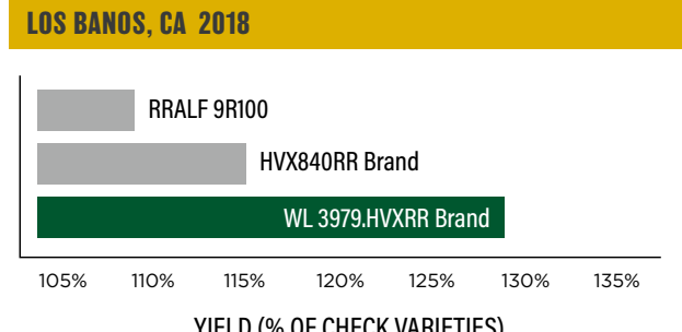
YIELD (% OF CHECK VARIETIES)